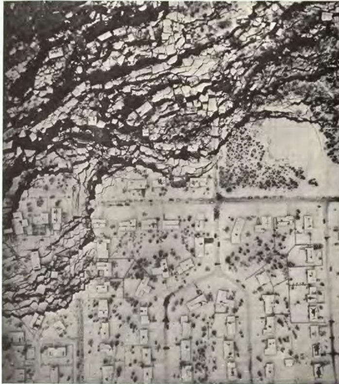
A portion of the Turnagain slide area immediately east from center of the slide. The toe of the slide is beyond the range of the photo.